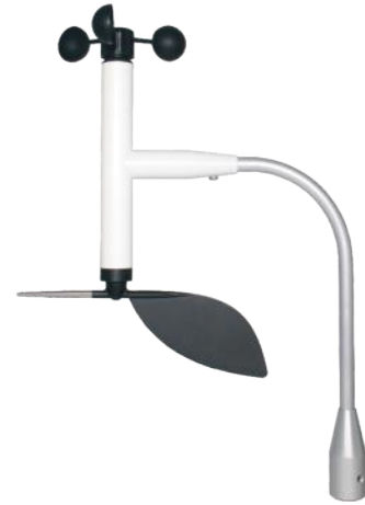
WSD 010-1 (standard range WSD sensor) WSD 011-1 (standard range WSD sensor)