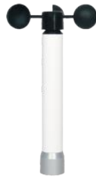
WS 010-1 (standard range WS sensor) WS 011-1 (standard range WS sensor)